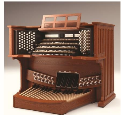
Infinity 489 Anniversary Edition

Chapel Music Company Division of A.E. Schlueter Pipe Organ Co. www.chapel-music.com 770-482-4845 • 251-382-3644