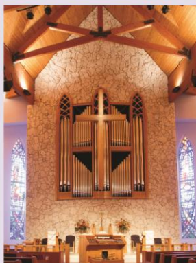
Advent Lutheran Church in Melbourne, Florida

Mechanical and tonal redesign and completion with major additions, resulting in a IV-manual, 93-rank pipe organ.