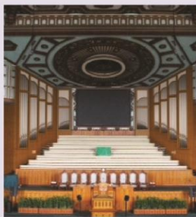
Iglesia ni Cristo in Quezon City, Philippines

Façade design for new 4-manual, 47-rank pipe organ, including two 2-manual console in adjacent chapels.