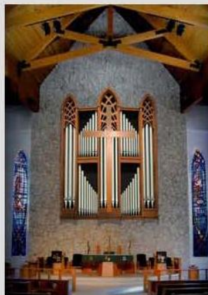
Advent Lutheran Church in Melbourne, Florida

Façade design for new 3-manual, 36-rank pipe organ.