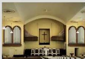
Friendship Baptist Church in Atlanta, Georgia

New 2-manual, 32-rank pipe organ, completed Spring 2012.