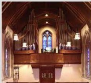
Covenant Presbyterian Church in Charlotte, North Carolina

New façade, rebuild with additions, 3-manual, 25-rank pipe organ, completed Spring 2012.