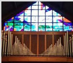
Episcopal Church of the Good Shepherd in Burke, Virginia

New façade, rebuild with additions, 3-manual, 25-rank pipe organ, completed Spring 2012.