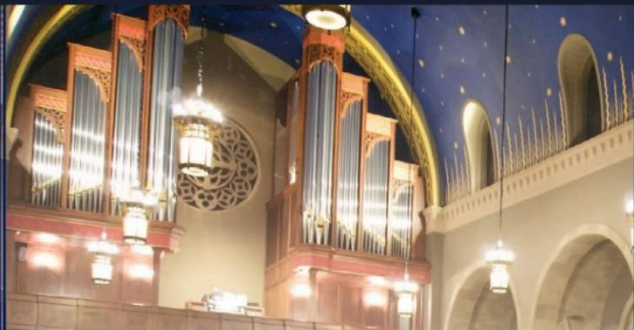
Kenrick-Glennon Seminary in St. Louis, Missouri New III/39 pipe organ

Our dedicated artisans take pride in every instrument we build and rebuild. We would be pleased to assist you with: