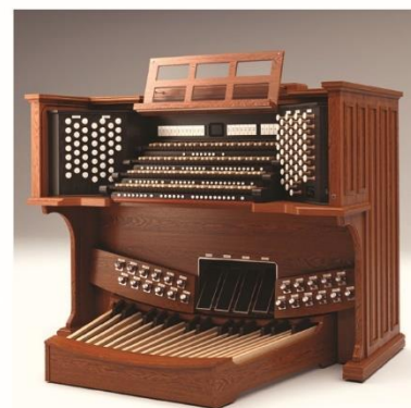
Infinity 489 Anniversary Edition