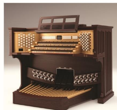
Infinity 367 Anniversary Edition