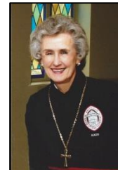
At the Schantz console; at the Schantz-Widener console; in front of the memorial window dedicated on her 50 th anniversary