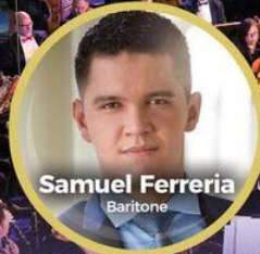
Samuel Ferreria Baritone

Elegant, timeless music performed by world-class artists