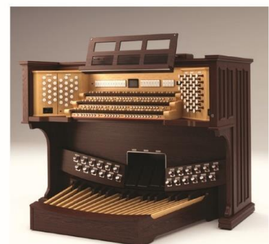
Infinity 367 Anniversary Edition