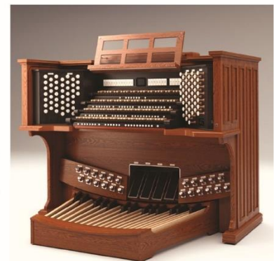
Infinity 489 Anniversary Edition