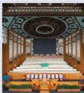
Iglesia ni Cristo in Quezon City, Philippines

Façade design for new 4-manual, 47-rank pipe organ, including two 2-manual console in adjacent chapels.