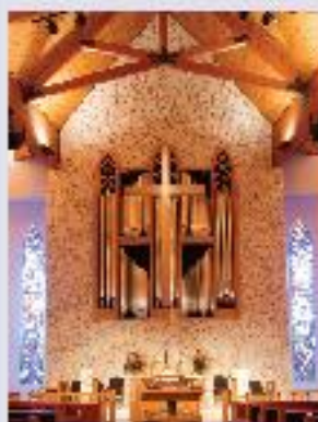
Advent Lutheran Church in Melbourne, Florida

Mechanical and tonal redesign and completion with major additions, resulting in a IV-manual, 93-rank pipe organ.