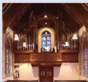
Covenant Presbyterian Church in Charlotte, North Carolina

New 3-manual, 36-rank pipe organ installed in the Fall of 2012, and dedicated in January 2013.