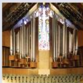
Tallowood Baptist Church in Houston, Texas

Façade design for new 4-manual, 47-rank pipe organ, including two 2-manual console in adjacent chapels.