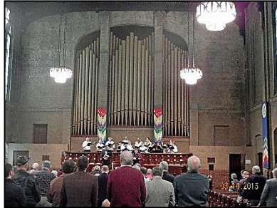
Service of Morning Praise