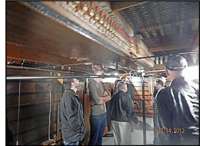
Inside the air chest